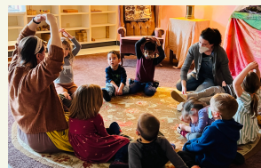
Firefly Morning Circle