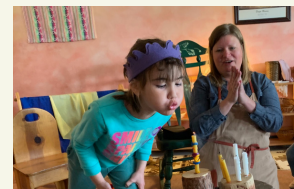
Butterfly Kinder Birthday