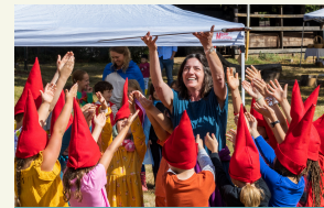
2nd Grade at Michaelmas