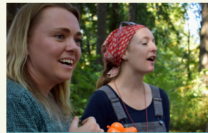
1st & 8th Grade Buddies

This year, our annual giving campaign is entirely dedicated to our faculty – supporting salaries, professional development, and future health benefits. Please share your appreciation for our teachers with your annual gift.